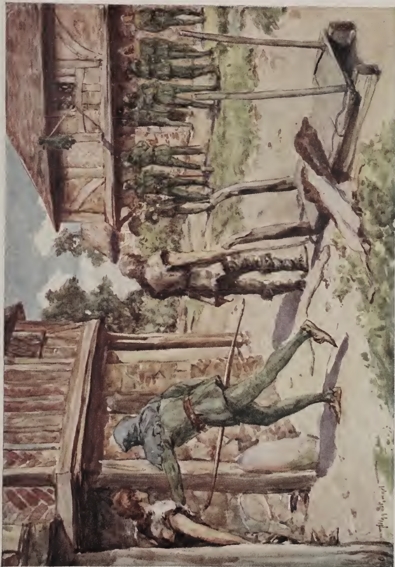
THE OUTLAW DASHED QUICKLY INTO THE INN.